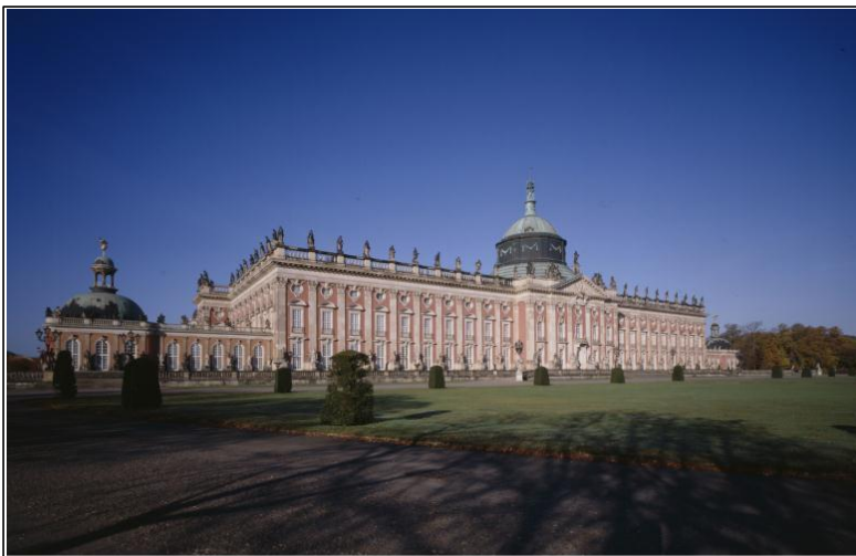
Potsdam, Park Sanssouci, Neues Palais, Gartenseite Stiftung Preussische Schlösser und Gärten Berlin-Brandenburg

To: Sanssouci garden and entrance New Palace